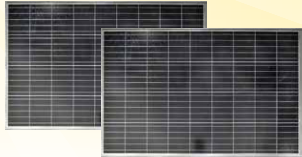
(2) 190W Monocrystalline Solar Panels

SOL 380 currently does not have upgrades available.