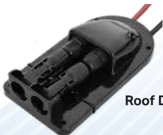
Roof Docking Port