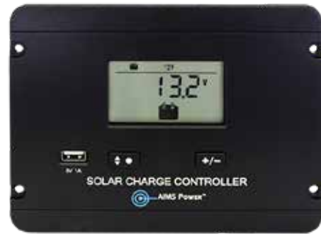
30 Amp Charge Controller