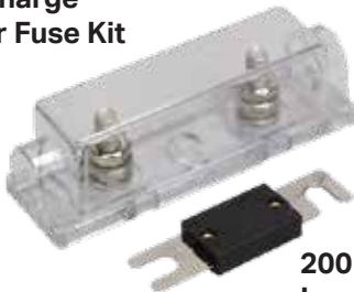
200 Amp Charge Inverter Fuse Kit