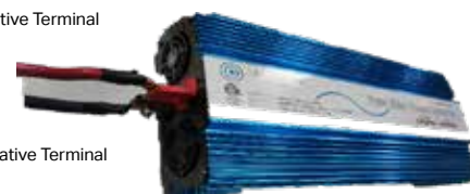
3 | Connecting Positive and Negative 2 Gauge Wire on the Inverter