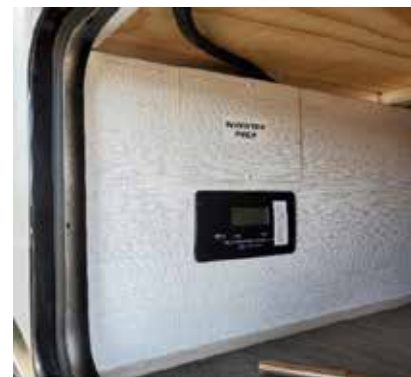
1 | Access Panel